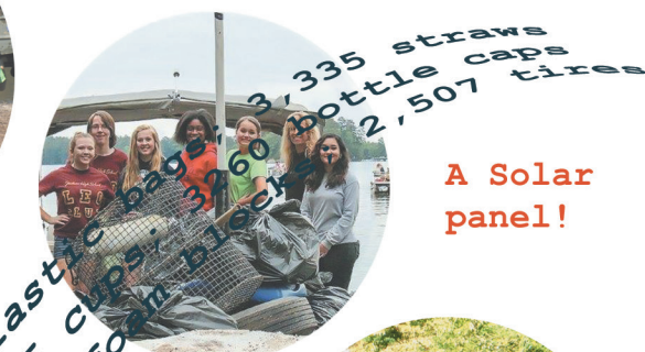
A Solar panel!